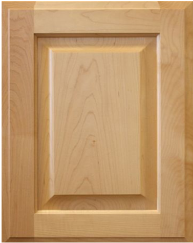
1. Raised Panel